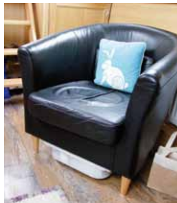
Above, A comfortable, cost bedroom complete with quilt; Far left, Side hatchway; Left, Free standing leather saloon chair; Below, ladder and stern hatchway.